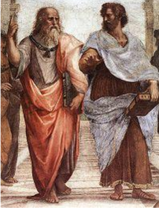
Plato (left) & Aristotle (right), a detail of The School of Athens, a fresco by Raphael. Aristotle gestures to the earth, representing his belief in knowledge through empirical observation and experience, while holding a copy of his Nicomachean Ethics in his hand, whilst Plato gestures to the heavens, representing his belief in the Forms.

Aristotle's father was a physician to the king of Macedon, so science had 'rubbed off' on him. At the age of seventeen, he went to Athens and joined Plato's school, where he stayed until Plato's death in 347.